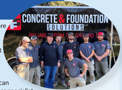
The team at Concrete & Foundation Solutions

get started and get more equipment. Currently, we use a Business Money Market Account and several small business loans.